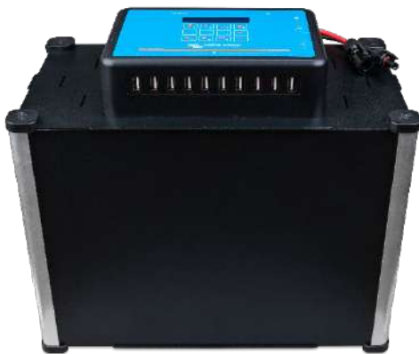
SHS 200 – mounted on optional battery box