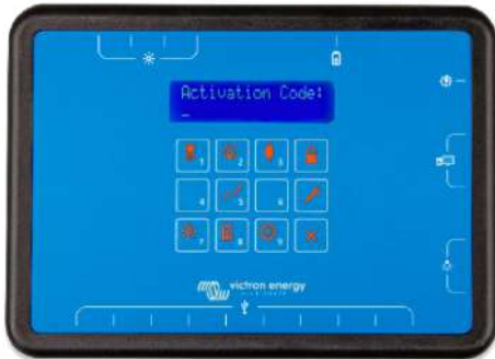
SHS 200 – Front view Keypad and LCD screen