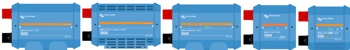
The Lynx modules: Lynx Power In, Lynx Class-T Power In, Lynx Distributor, Lynx Shunt VE.Can and Lynx Smart BMS