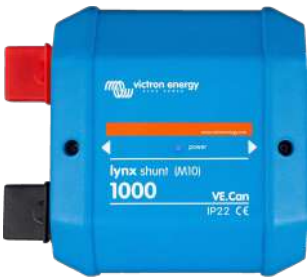
Lynx Shunt VE.Can (M10) model