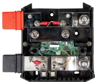
Lynx Shunt VE.Can (M10) with fuse dummy busbar installed