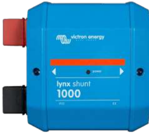
Lynx Shunt VE.Can (M8) model