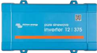
Inverter 12/375 VE.Direct