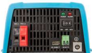
Inverter 12/375 VE.Direct