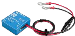
Bluetooth sensing Smart Battery Sense