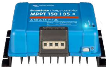
SmartSolar Charge Controller MPPT 150/35