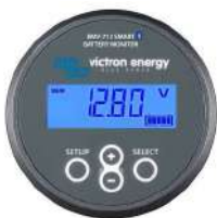
Bluetooth sensing BMV-712 Smart Battery Monitor