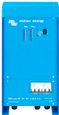
Skylla TG 24 30 GMDSS