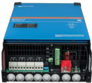
Connection Area Quattro-II 48/5k