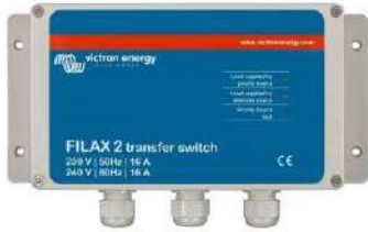
Filax 2: ultrafast transfer switch