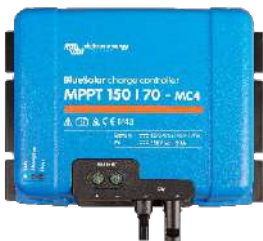
Solar Charge Controller MPPT 150/70-MC4