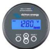
Bluetooth sensing: BMV-712 Smart Battery Monitor or SmartShunt