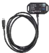
VE.Direct Bluetooth Smart Dongle