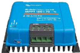
Solar Charge Controller MPPT 150/70-Tr