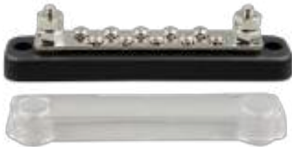
Busbar 150 A 2P with 10 screws and cover