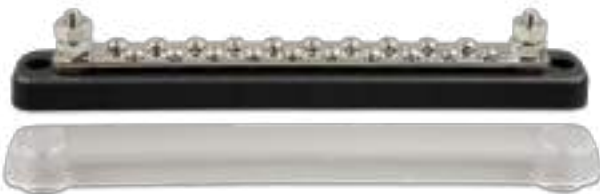
Busbar 150 A 2P with 20 screws and cover